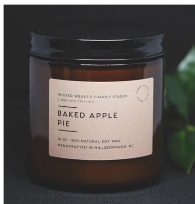
DAVANTI NOVEMBER BATH BOMB

Fresh baked, warm apple pie right out of the oven. You can't go wrong with the aroma of fresh apple pie with a flaky buttery crust. Enjoy! 40 hr minimum burn time.