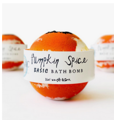
DAVANTI NOVEMBER BATH BOMB

Pumpkin Spice Bath Bomb. Sunflower Oil and Vitamin E Oil mix to moisturize and hydrate for perfectly silky smooth skin. Topped with Black lava Sea Salt. Smells like: Pumpkin Pie