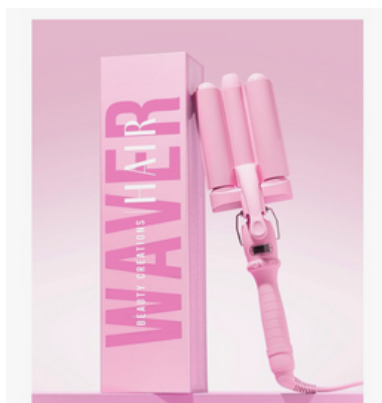
DAVANTI THE WAVER

Solid Pink Waver Wand. Tourmaline Ceramic Technology protects and boosts shine. Up to 450 degrees w/LCD temp display.