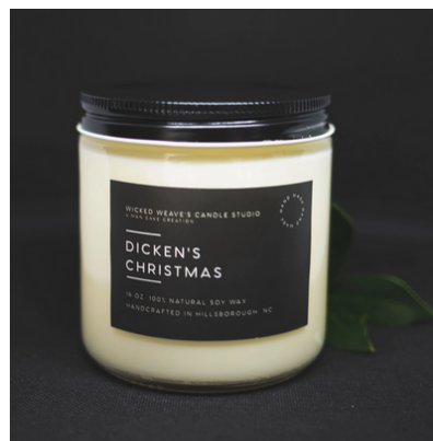
DAVANTI DECEMBER BATH BOMB

This sweet and spicy scent of warm cinnamon, nutmeg with clove blended with a fruity and musky background that will remind you of Christmas past. 40 hrs minimum burn time.