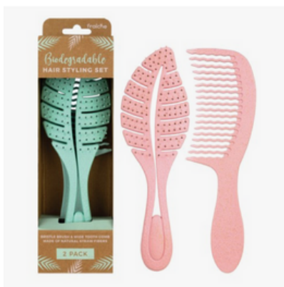
DAVANTI DETANGLING SET