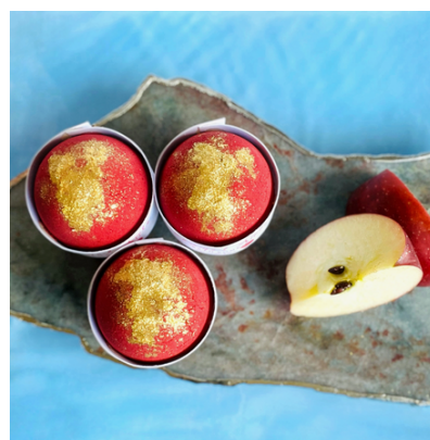
DAVANTI DECEMBER BATH BOMB

Caramel Apple Bath Bomb. Sunflower Oil and Vitamin E Oil mix to moisturize and hydrate for perfectly silky smooth skin. Smells like: Caramel Apple Pie