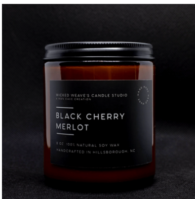
DAVANTI OCTOBER BATH BOMB

Black Cherry Merlot is a boozy, sophisticated twist to the classic black cherry. Enjoy! 40 hr minimum burn time.