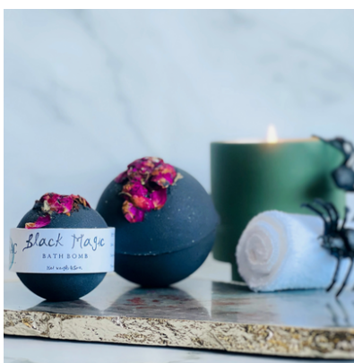
DAVANTI OCTOBER BATH BOMB

Black Magic Bath Bomb. Sunflower Oil and Vitamin E Oil mix to moisturize and hydrate for perfectly silky smooth skin. Topped with Rose Petals. Smells like: Rose, Orange Zest, Vanilla, and a touch of Cardamom